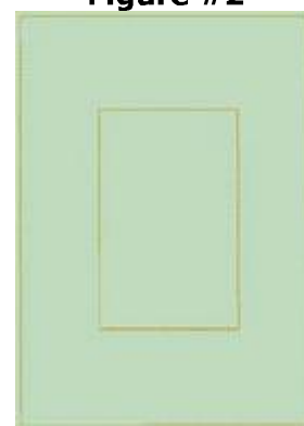
Color #1 Appliqué Material