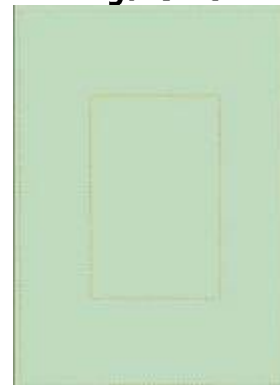
Color #2 Appliqué Position